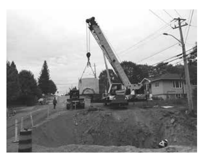
Emily Street reconstruction

The contractor has started on the southern section. next to Sequin Township. The large culvert at Fowler Drive is currently being replaced. It is a very old and deep culvert, and the storm water has been pumped around the site to expedite the replacement. Traffic control measures are in effect, and everyone's patience is appreciated.