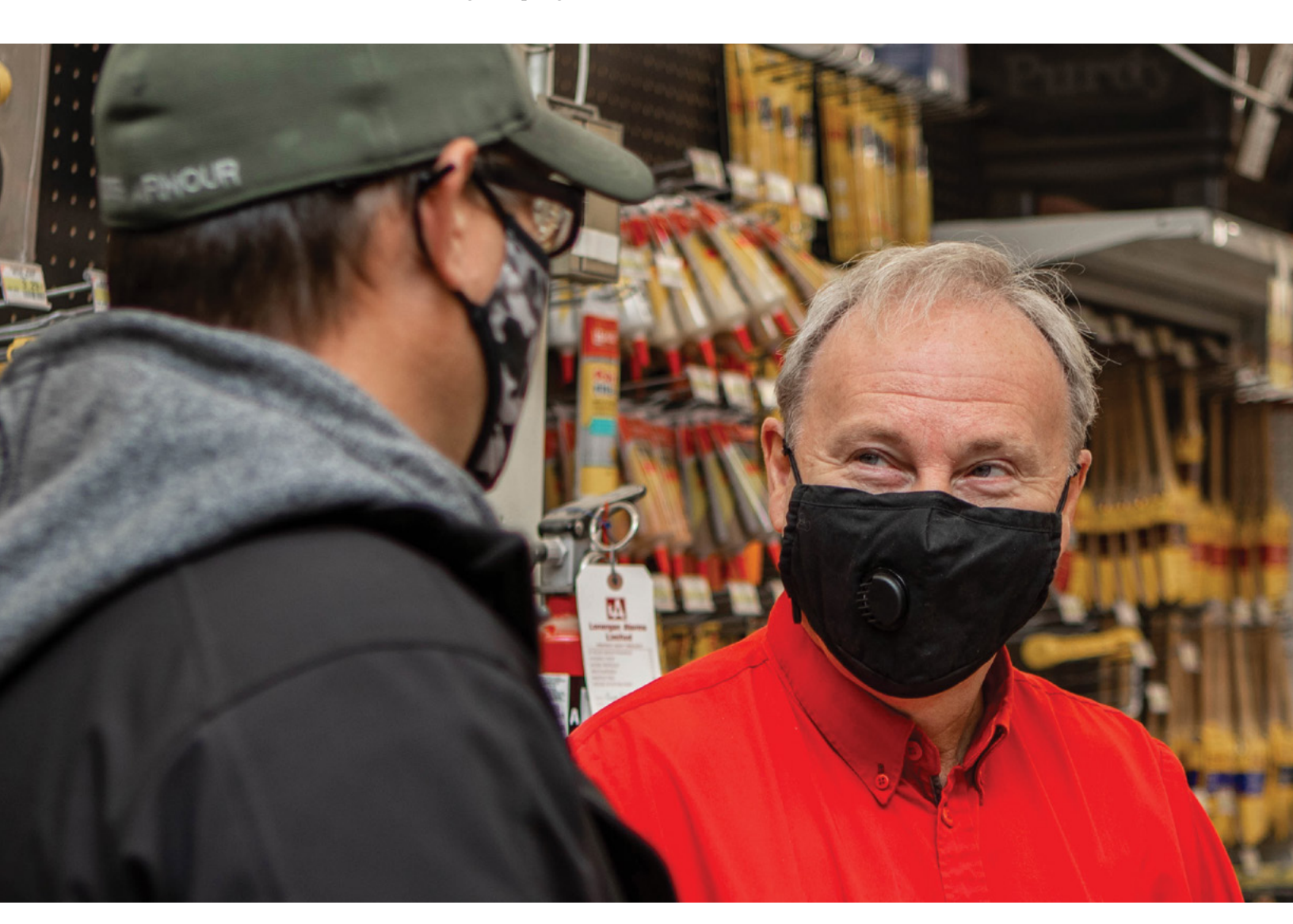
Our Mayor prides himself on being accessible to the community. Here he is chatting with a local resident.