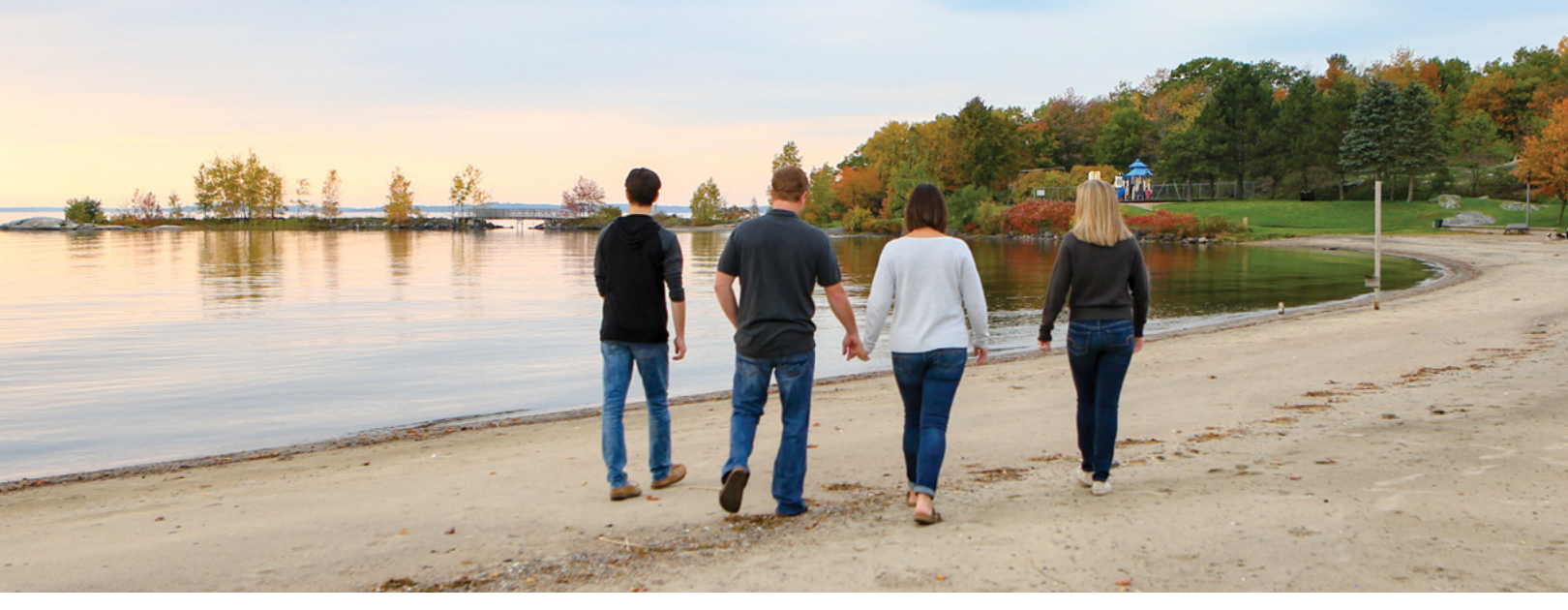
Waubuno Beach, located right in town on the sandy shores of Georgian Bay, is a popular place to swim, play and relax.