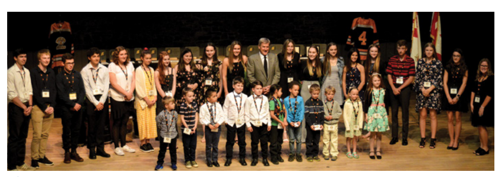
These are the nominees for the 2019 Bobby Orr Hall of Fame Celebrating Youth Award, pictured with Bobby Orr.