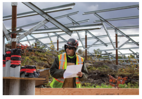
Hot idea! The solar field project, pictured here and on the opposite page, is part of the SPEEDIER smart grid project. More than 200 solar panels will help offset the Town's energy load, and provide a steadier stream of power to local households.

To manage electrical loads and reduce energy consumption, some local residents and businesses in the SPEEDIER micro-grid test area volunteered to install hot water tank controllers. Hot water tank controllers will allow Lakeland Power to reduce energy consumption at peak times if there are constraints on the amount of electricity. Water tank controllers were also installed at the Town's Transfer Station, Wastewater Treatment Plant and Operations Building, along with a Tesla Powerwall. Ten Tesla Powerwalls, large batteries that economically charge during off-peak hours and consume power on-peak, and Level 2 vehicle-charging stations, were also fitted around the community.