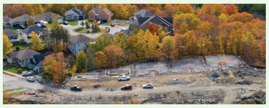
Site preparation for Phase 2 of the Hall Construction subdivision Thunder Creek began in 2019. Shortly after the Housing Summit, the owner "up-zoned" the subdivision to medium density residential. The subdivision is located at the end of Winnifred Avenue behind the Parry Sound High School.