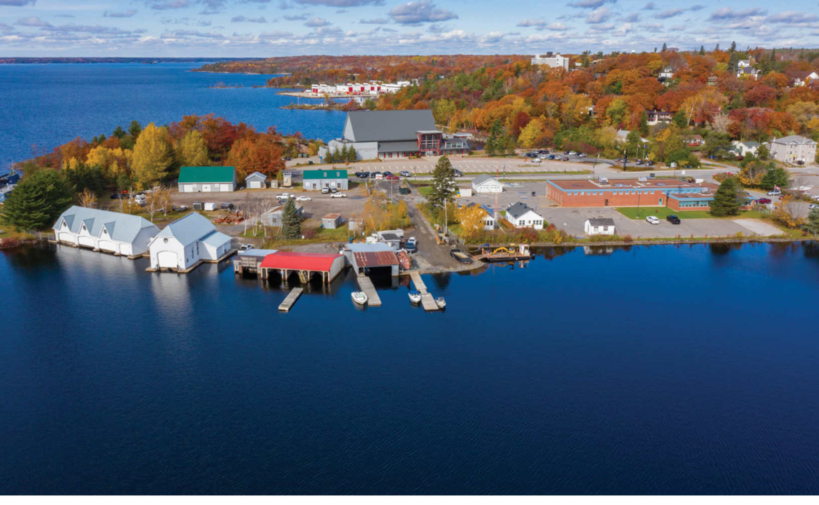
Planning for the future. The Town is putting pieces into place to develop the waterfront.