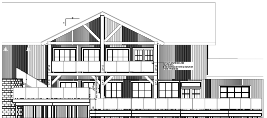
4 ELEVATION Scale 1:40