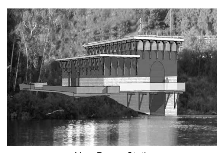
New Power Station

Maple Reinders is the General Contractor for the project. It is projected that $4 million will be spent locally on labour and materials. Craig Sparks is the contact and can be reached at CraigS@Maple.ca if you have an inquiry about this construction project.